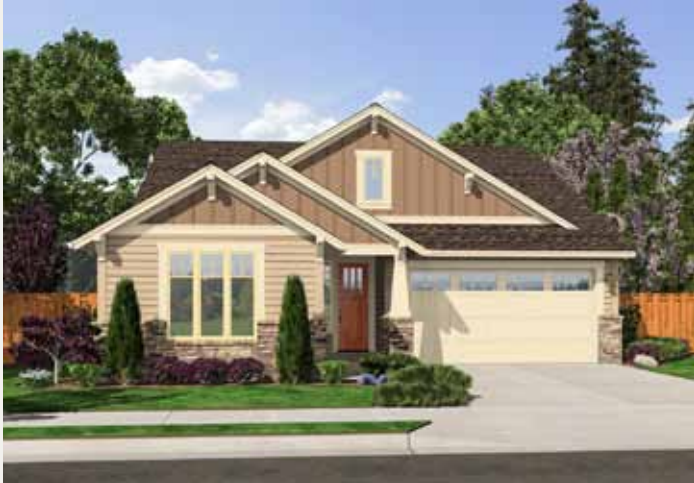
THE JUNIPER ~ ELEVATION A