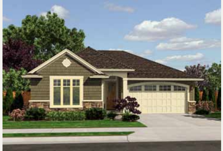
THE JUNIPER ~ ELEVATION B