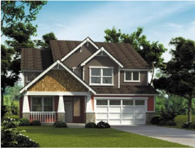
WASHINGTON PLAN A