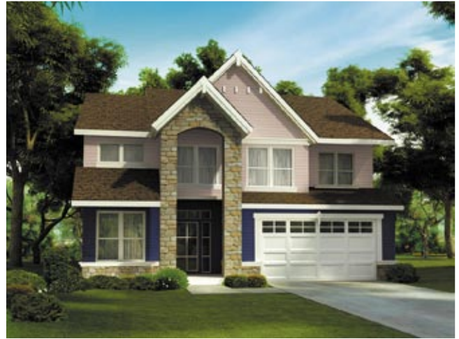
WASHINGTON PLAN B