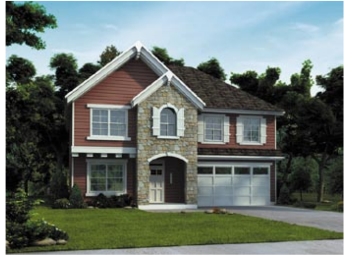
ADAMS PLAN B