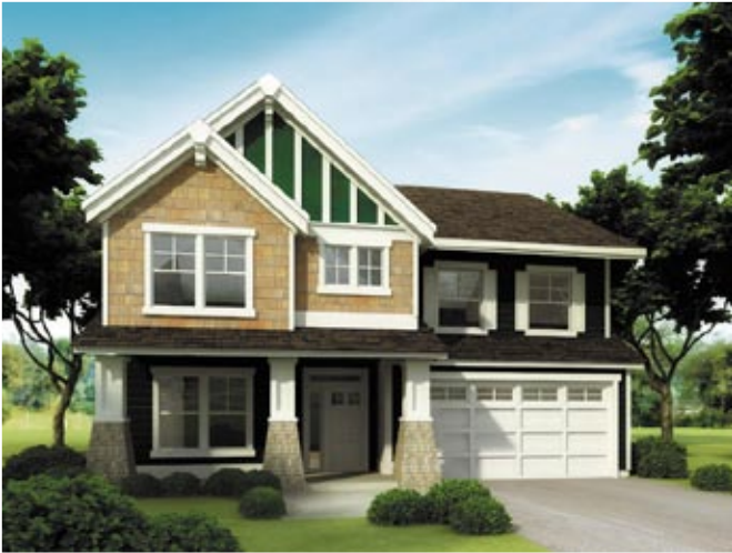
ADAMS PLAN A